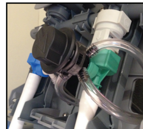
Shown on 830GAP